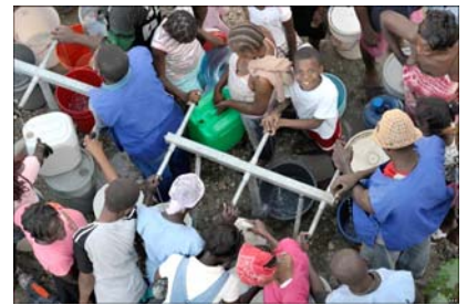
ABOVE: PICTURE FROM HAITI.