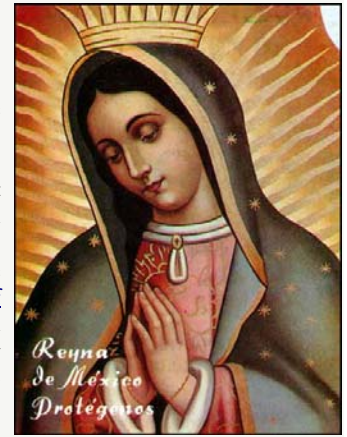
ABOVE: A picture of Our Lady of Guadalupe. BELOW: Juan Diego, the saint who introduced people to the apparition.

CLICK HERE TO LISTEN TO A FAMOUS OUR LADY OF GUADALUPE SONG!